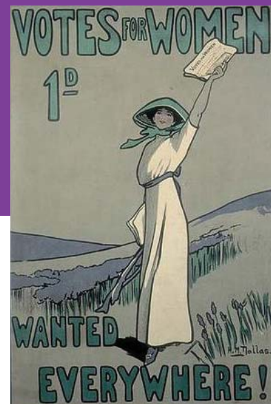
WSPU poster by Hilda Dallas 1909