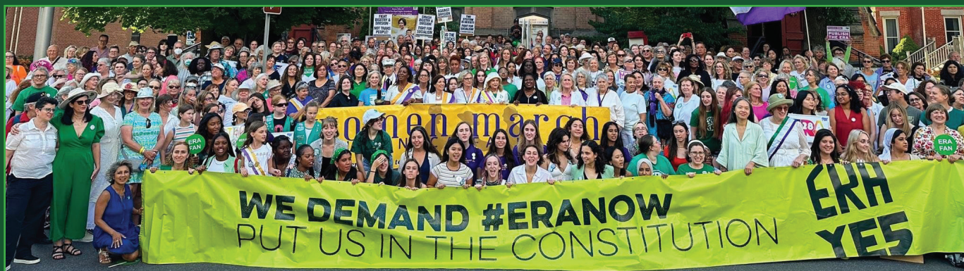
ERA Centennial Convention, Seneca Falls, NY - July 21, 2023

For more information about the Equal Rights Amendment, including local events, actions you can take, and recent publications, visit https://marylandnow.org/take-action-for-the-era/