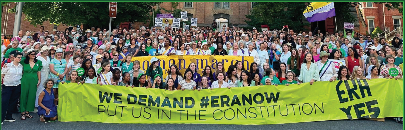
ERA Centennial Convention, Seneca Falls, NY – July 21, 2023

This ERA Fact Sheet was created by the Maryland NOW ERA Task Force.